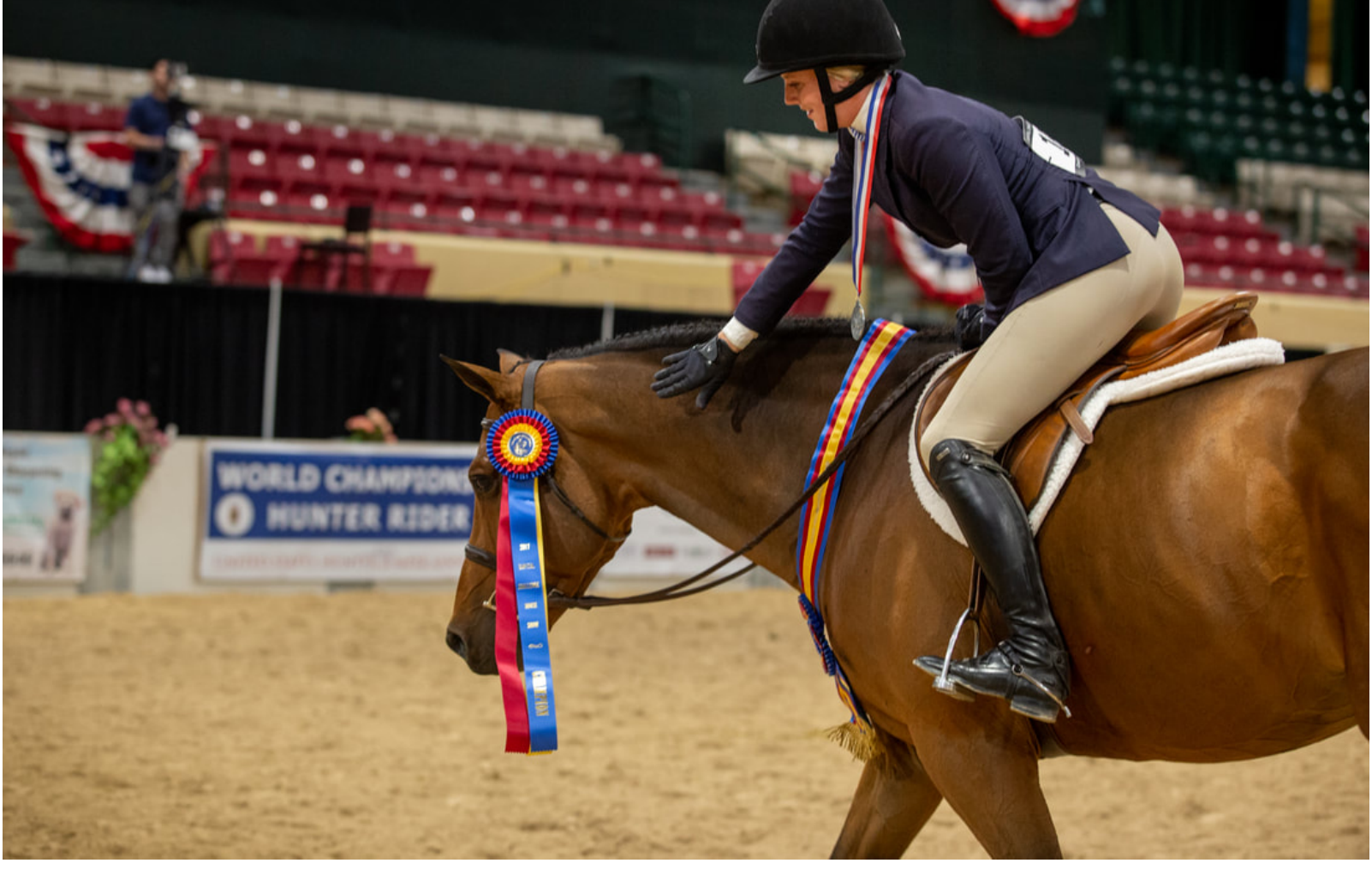
The Capital Challenge Horse Show staff is eager to welcome competitors back to the Prince George's Equestrian Center for its 28th edition.

The prize list will be available on Tuesday, August 3, for review and entries open on Wednesday, August 4. Keep reading to meet our featured sponsor, rider, and staff member, and be sure to follow us on Facebook , Twitter , and Instagram for all the latest updates.